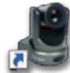
PTZ Camera Controller

From Selected Camera drop down menu, select either Back Camera or Front Camera